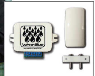
Wired and wireless detection devices can be placed almost anywhere