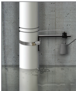
1 Monitor sump pump pit water level